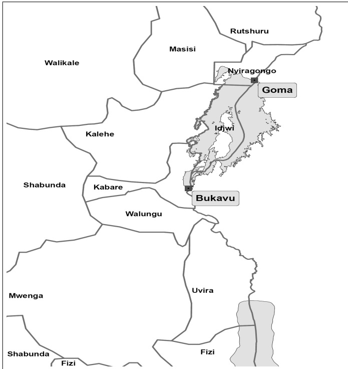
Map 1 Voix des Kivus operates in four villages in South Kivu.