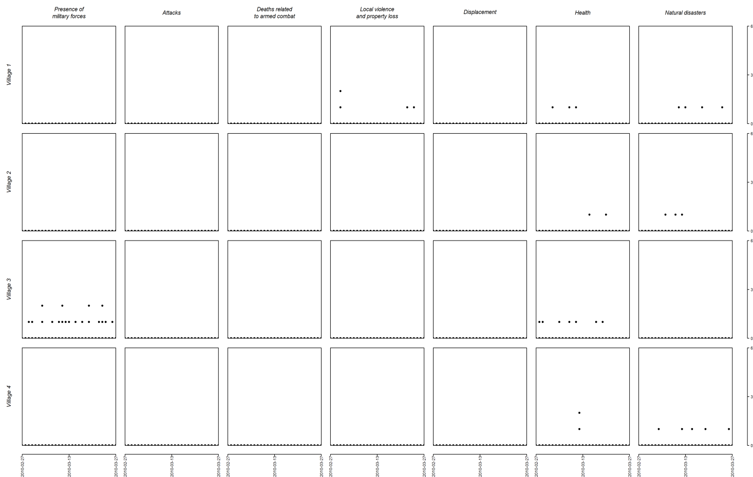
Table 2 Each point represents a unique reported event of a given type. Two reports of the same type received within 24 hours of each other from different reporters in the same village are counted as a single event. Event reporting has not been independently verified by Voix des Kivus .